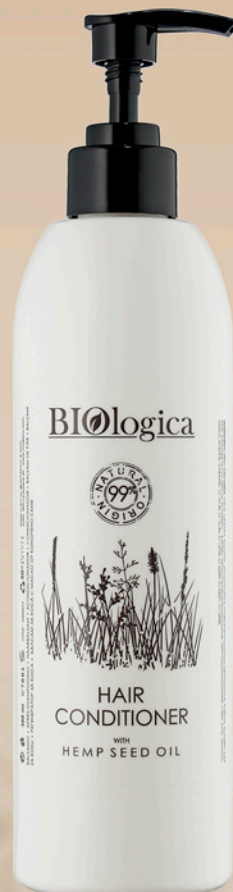
• Hair conditioner 380 ml.