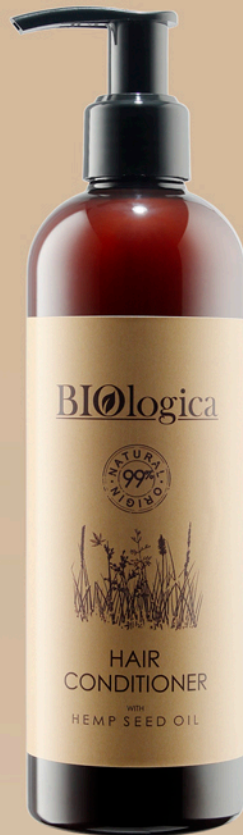
• Hair conditioner 350 ml.