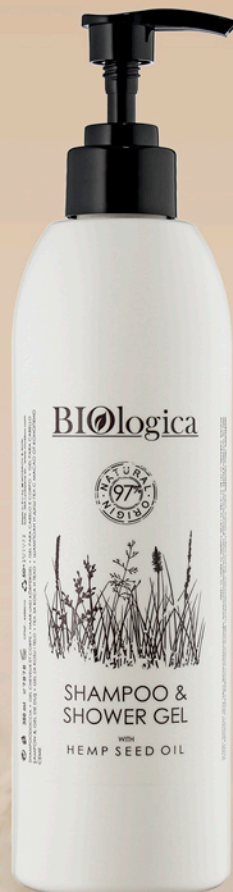
• Shampoo & Shower gel 380 ml.