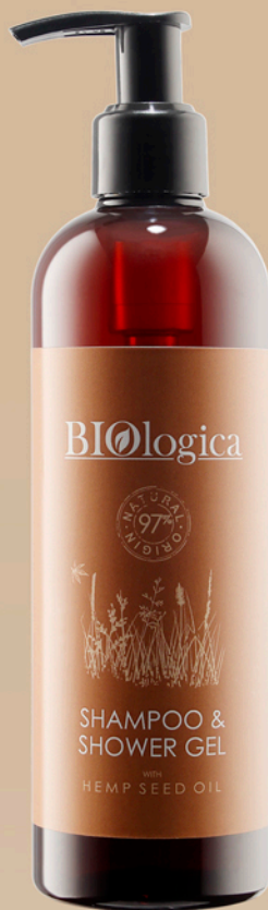
• Shampoo & Shower gel 350 ml.