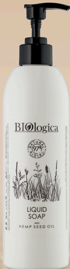
• Liquid soap 380 ml.