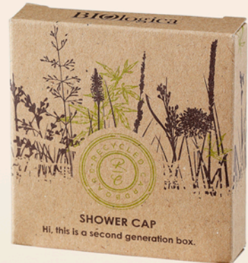
• Shower cap