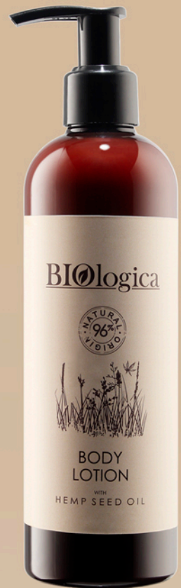
• Body lotion 350 ml.