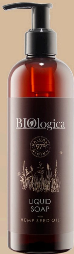
• Liquid soap 350 ml.