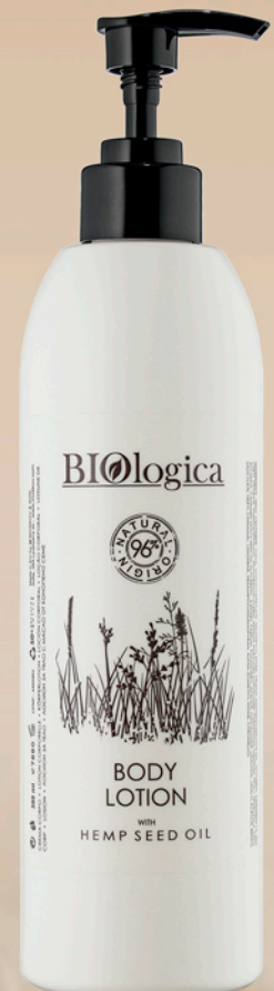
• Body lotion 380 ml.