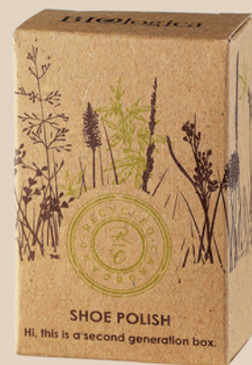
• Shoe polish