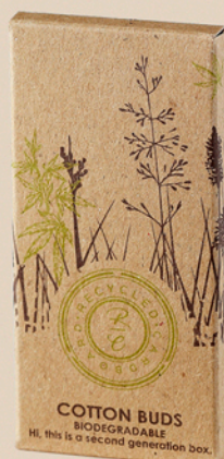
• Cotton buds