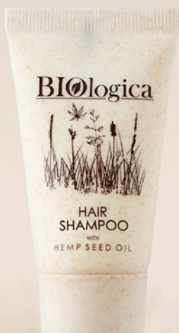
• Shampoo 30 ml.