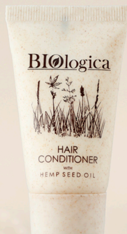
• Hair conditioner 30 ml.