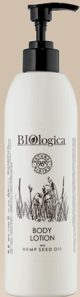
• Body lotion 380 ml.