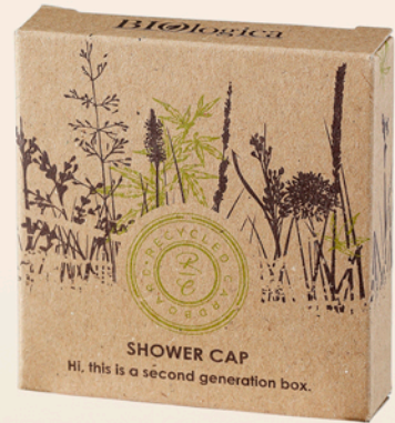
• Shower cap