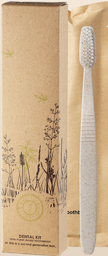
• Dental kit