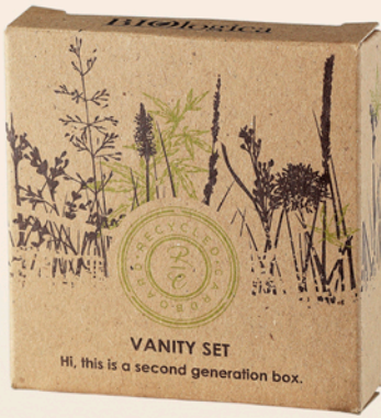
• Vanity set