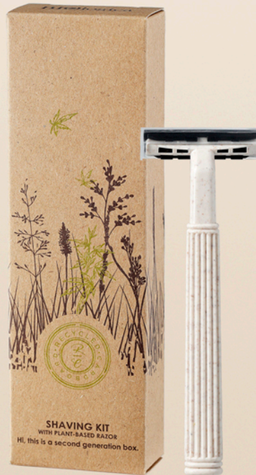
• Shaving kit