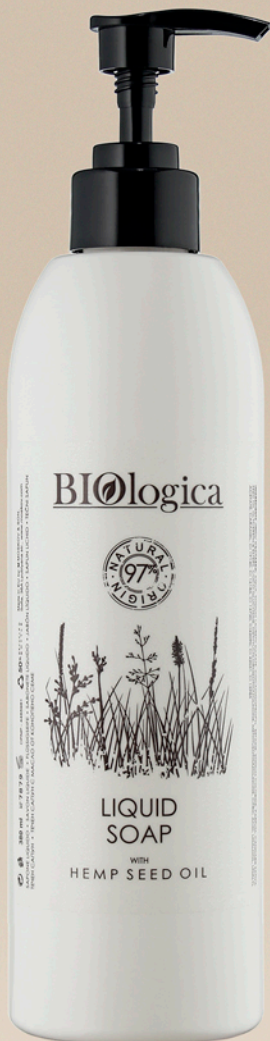
• Liquid soap 380 ml.