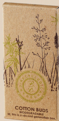
• Cotton buds