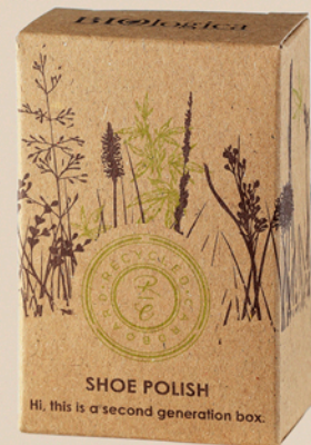
• Shoe polish