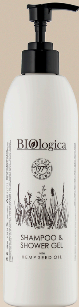
• Shampoo & Shower gel 380 ml.