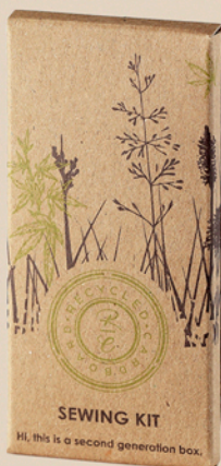
• Sewing kit