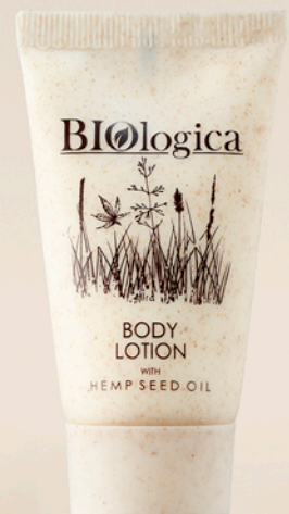
• Body lotion 30 ml.

* The tubes are made of 40% of sugar cane.