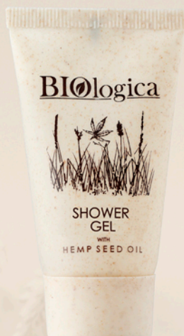
• Shower gel 30 ml.