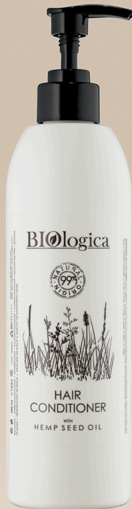
• Hair conditioner 380 ml.