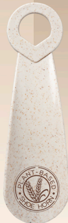
• Wheat straw shoe horn.