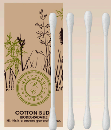
• Cotton swabs with paper stick.