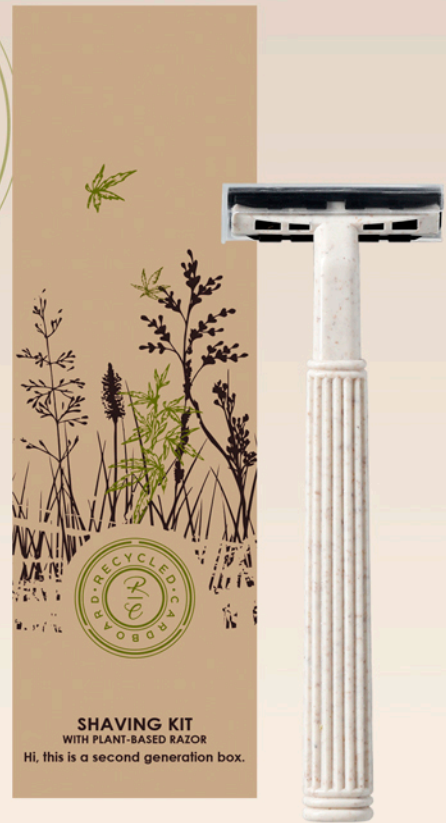
• Wheat straw razor.