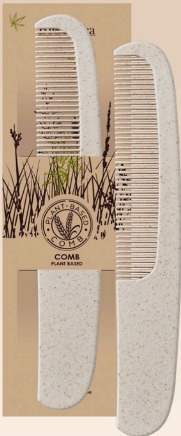
• Wheat straw comb.