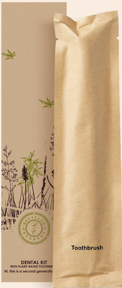
• Wheat straw toothbrush.